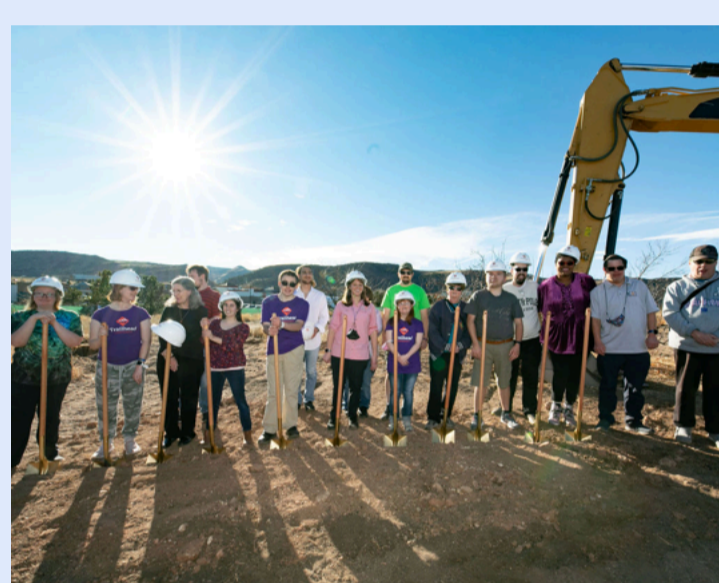
Photo: Trailhead Community Residents at construction site of their future home

Trailhead Community has partnered with First Western Trust Bank and Colorado Housing Finance Authority (CHFA) to fund the construction of the $20,690,000 building.